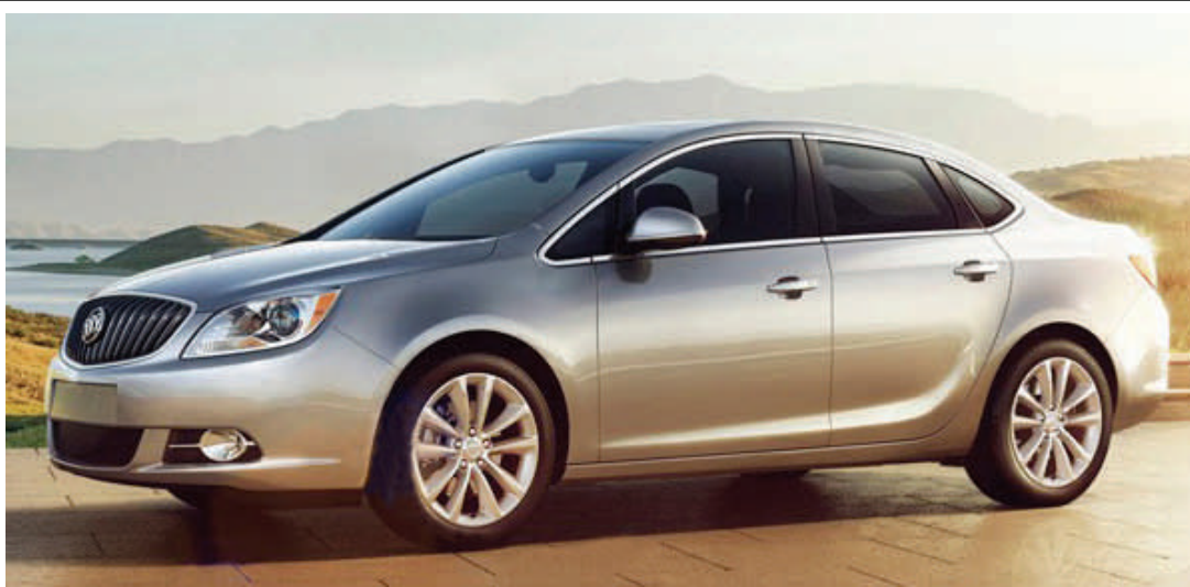
2012 Buick Verano